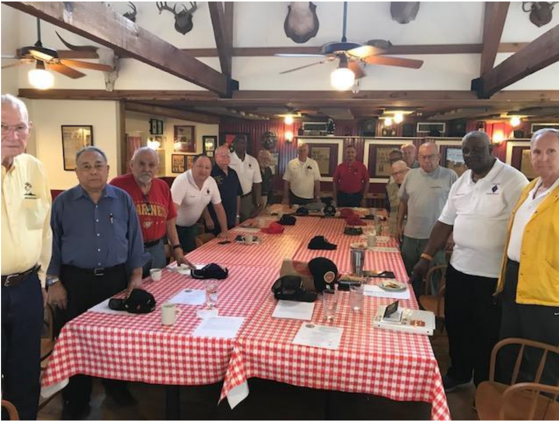
ALAMO CHAPTER MEETING